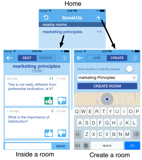
Figure 1: The SpeakUp mobile app.

(see Figure 1). There is no sign-up process and users are never required to enter any personal information.